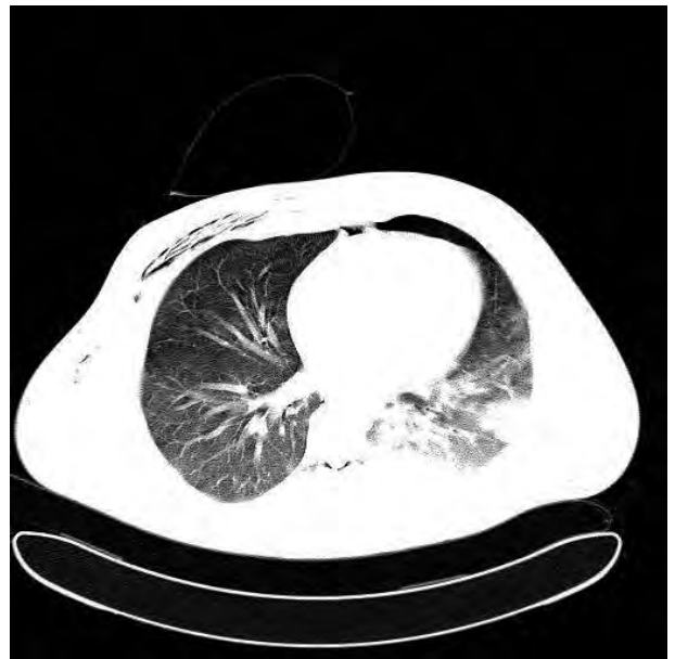
Figure 1. Lung axial section with window. Air in right anterior thoracic wall is observed. Left anterior pneumothorax. Pulmonary contusion on left base and air in epidural space at level D8 (pneumorachis).