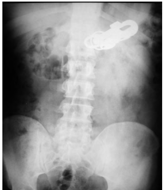
Figure 1. Simple x-ray of abdomen showing foreign body.

FBs in the oesophagus usually require extraction six hours before the last food intake. By contrast, objects are often retained in the gastric cavity for long periods with no symptoms and, depending on the nature of the FB, treatment may be expectant. Endoscopic extraction is possi-