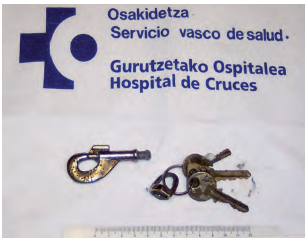
Figure 4. Extracted foreign bodies.