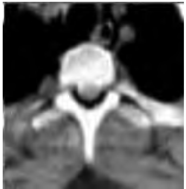
Figure 2. Mediastinum axial section with window centred on D2. Detail of pneumorachis.