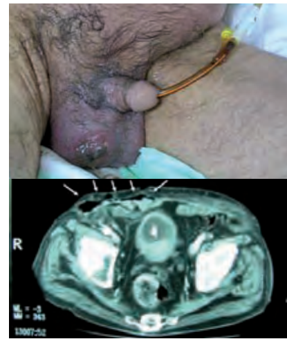
Figure 1. Image showing increased size right testicle with ulcerated lesion and drainage (above). Abdominal CT scan showing a collection of gas bubbles in front of the anterior rectus (below, arrows).