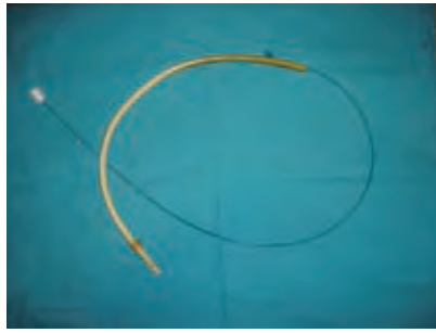
Figure 2. Foley catheter with Drum® catheter guidewire used in this case.

the impossibility of replacing a Foley nº 15 catheter. He had used the bladder catheter during several months for various episodes of urine retention, and the only relevant medical history was possible prostate gland cancer (specific PSA 25 ng/ml) for which he was awaiting evaluation for transurethral resection. We found it impossible to deflate the balloon with a syringe using the traditional method of saline extraction. We decided to cut the distal end of the catheter just above the fork, in order to eliminate the possible effect of the retaining valve of the drainage port. Even so, the catheter continued to resist attempts at extraction. Suspecting that the balloon could have burst and the catheter was attached to the walls of the urethra, bladder ultrasound was performed by the radiologist who observed that the balloon was inflated (Figure 1).