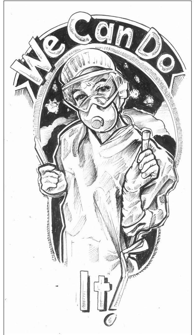
Figure 4. Together we will make it.

People from the so-called developed countries feel very safe against infectious agents that are considered to be typical of other latitudes. This is the first pandemic in several generations that has raised doubts about collective security. It has made us see something that experts have been announcing for some time: our vulnerability to highly contagious infectious agents, such as this one 6,7 .