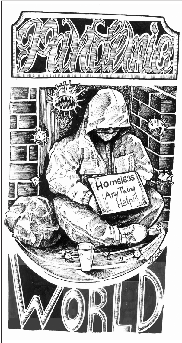
Figure 3. We are vulnerable.

People from the so-called developed countries feel very safe against infectious agents that are considered to be typical of other latitudes. This is the first pandemic in several generations that has raised doubts about collective security. It has made us see something that experts have been announcing for some time: our vulnerability to highly contagious infectious agents, such as this one 6,7 .